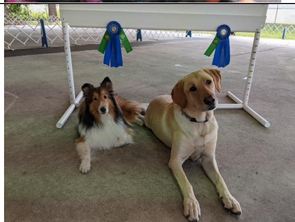
Coco and Rex