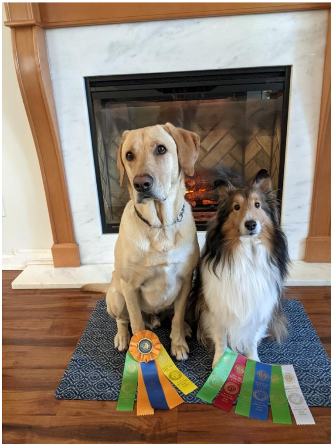
Rex and Coco

Coco leg 2 - Open A - 1st pl; leg 8 - rally advanced & excellent combo (RAE) Rex Novice title (CD)