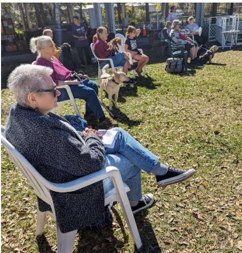
Several k9 members attended the fetch workshop to learn about the newest AKC sport title.

Retriever – the dog earns the FTR (Fetch Retriever)