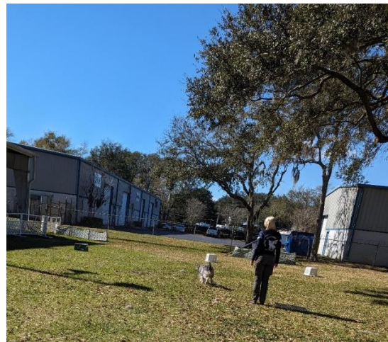
Silke Royer sends Saga to fetch the bumper