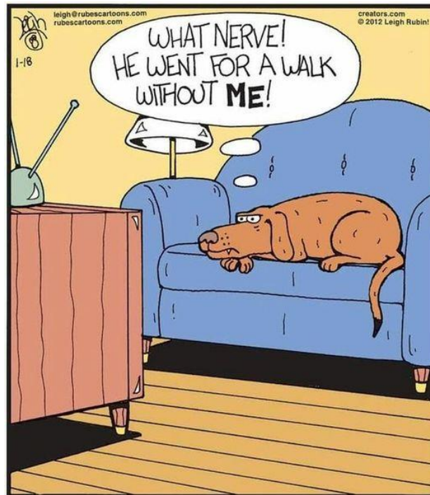
Neil Armstrong's dog, July 21, 1969