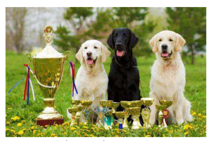
Trial Awards Donations

If you would like to support the K-9 Obedience and Rally Trials for May 4 & 5, 2024, consider contributing to the awards fund. K-9 gives many ribbons, trophies, and rosettes, for 1<sup>st</sup>, 2<sup>nd</sup> ... placements, special rosettes for outstanding achievement categories and even cash prizes for the high scoring dogs in 4 categories.