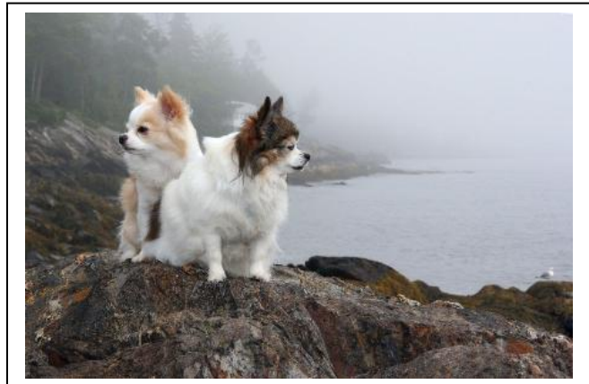
Above – Cami (left) and Harley (right) "on the rocks" in Maine.