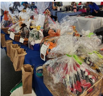
The basket raffle table