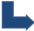
Indian River Dog Training Club Rally Trials – Melbourne, FL (July) RE – two legs NEW TITLE!!